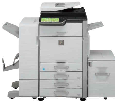
Base Unit 1K Saddle Stitch Finisher (MX-FN10) Punch Module (MX-PNX5A/C/D) Stand with 2 x 500-Sheet Paper Drawers Paper Pass Unit / Exit Tray / Large Capacity Tray