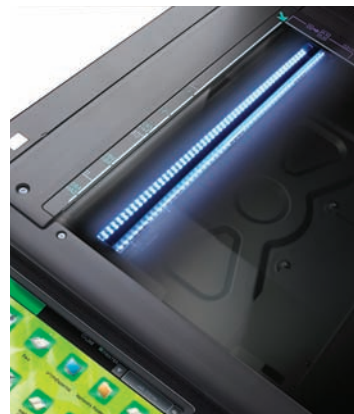
Low energy LED scanning light