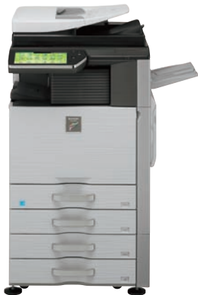
Base Unit Finisher (MX-FNX9) Stand with 2 x 500-Sheet Paper Drawers / Exit Tray