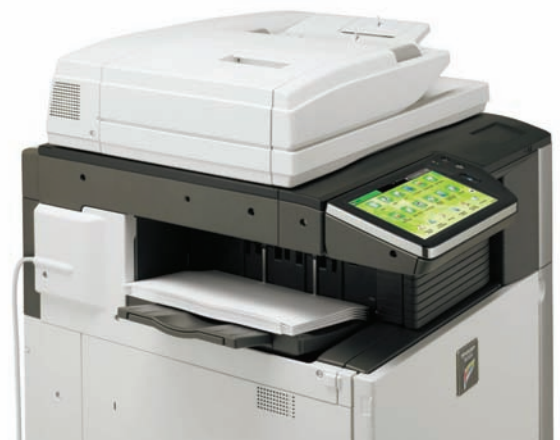
MX-5112N shown with optional inner finisher

Need variety? No problem! Now you can work with paper in sizes from A5 to A3 wide, with weights of up to 256 gsm. Creating large volumes of professionally presented documents is easy, too, thanks to a wide range of finishing options. Choose from a space-saving inner finisher for simple sorting and stapling, an A3 wide saddle stitch finisher, standard and high-capacity finishers with stapling, saddle stitching and booklet making capabilities and a variety of hole punch modules.