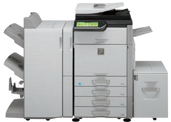
Base Unit 4K Saddle Stitch Finisher (MX-FN18) Punch Module (MX-PNX6A/C/D) Stand with 2 x 500-Sheet Paper Drawers Paper Pass Unit / Exit Tray / Large Capacity Tray