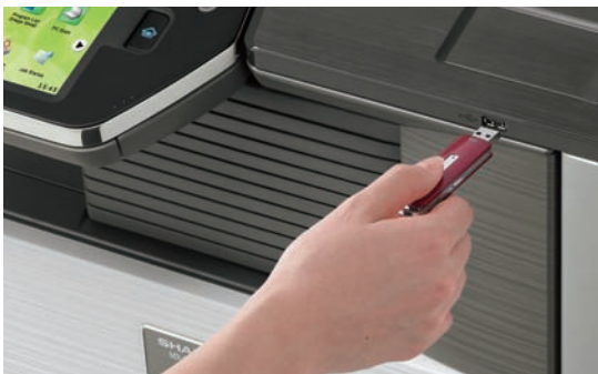
'Walk-up Printing' thanks to convenient USB ports

As you'd expect from Sharp, we've made ease-of-use a major design priority with useful features such as dual USB ports for walk-up, driverless printing of PDF* 1 , TIFF, XPS* 2 , and JPEG files. You also get a wide range of document processing and handling tools, supported by on-screen 1 page, 3D and thumbnail previews. And, thanks to finger-swipe technology, you can touch and slide to rotate, re-order, delete and insert pages into the document before you start the print run. Each user can have a customised home screen with a choice of backgrounds and shortcuts to their most frequently used features and applications, and navigating from function to function is quick and intuitive. A retractable keyboard can be added for easy data entry.