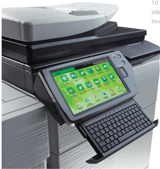
10.1 inch, 3-way adjustable colour touch screen

The 41 pages per minute (ppm) MX-4112N and the 51 ppm MX-5112N can cope with the heaviest workloads. And as well as having an inherently robust design, they come with a suite of sophisticated support and management tools to keep human intervention to a minimum: another plus for productivity.