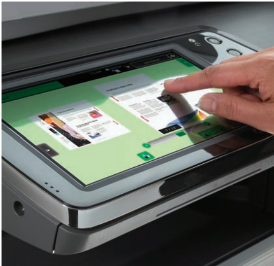
Finger-swipe touch control for intuitive operation of every function

The days of struggling to understand colour MFPs are coming to an end. Why? Because Sharp has added 'finger-swipe' control to two of the world's most productive A3 office multifunction systems.