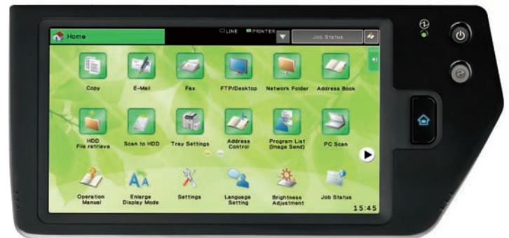
Access User Manual directly from the MFP panel.

Printer Status Monitor Check the MFP's operating status from your PC before you start a job, to be sure there's sufficient toner and paper. As soon as your documents are ready an alert will appear on your desktop. It's easy.